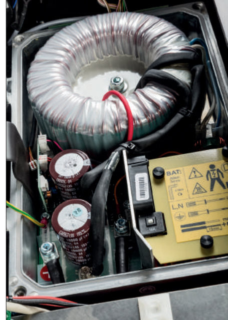
View into the inner sanctum: This switching converter generates the mains off of the battery voltage