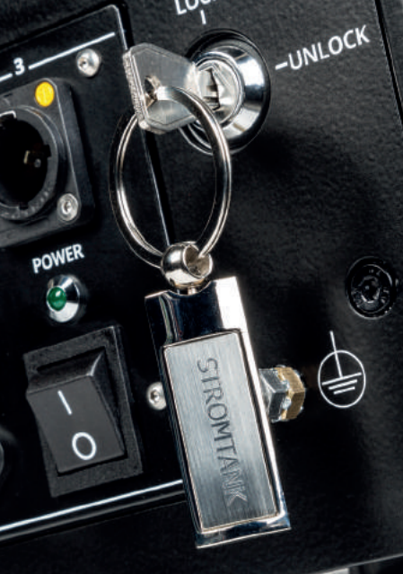
Nothing works without it: the key must remain on the device during operation