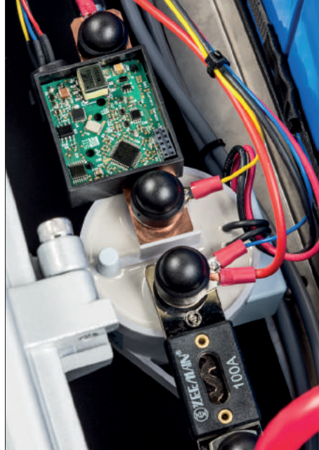
In case something happens: The fuse will blow if things go too fast for the big relay.