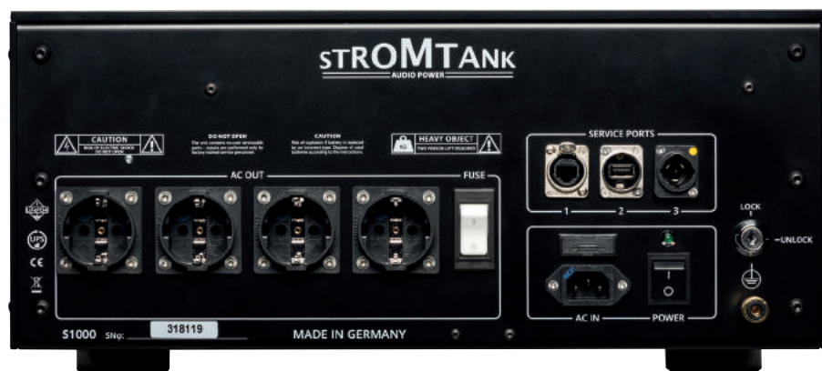
Four devices can be connected directly to the unit, beyond that an external distributor is required

To start up the system, you absolutely need the „ignition key“, in addition you have to operate the main switch and the input-side circuit breaker. After various very solid sounding tinkling noises inside, one may indulge in the blessings of the device. I